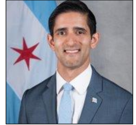
Samir Mayekar Deputy Mayor for Economic and Neighborhood Development