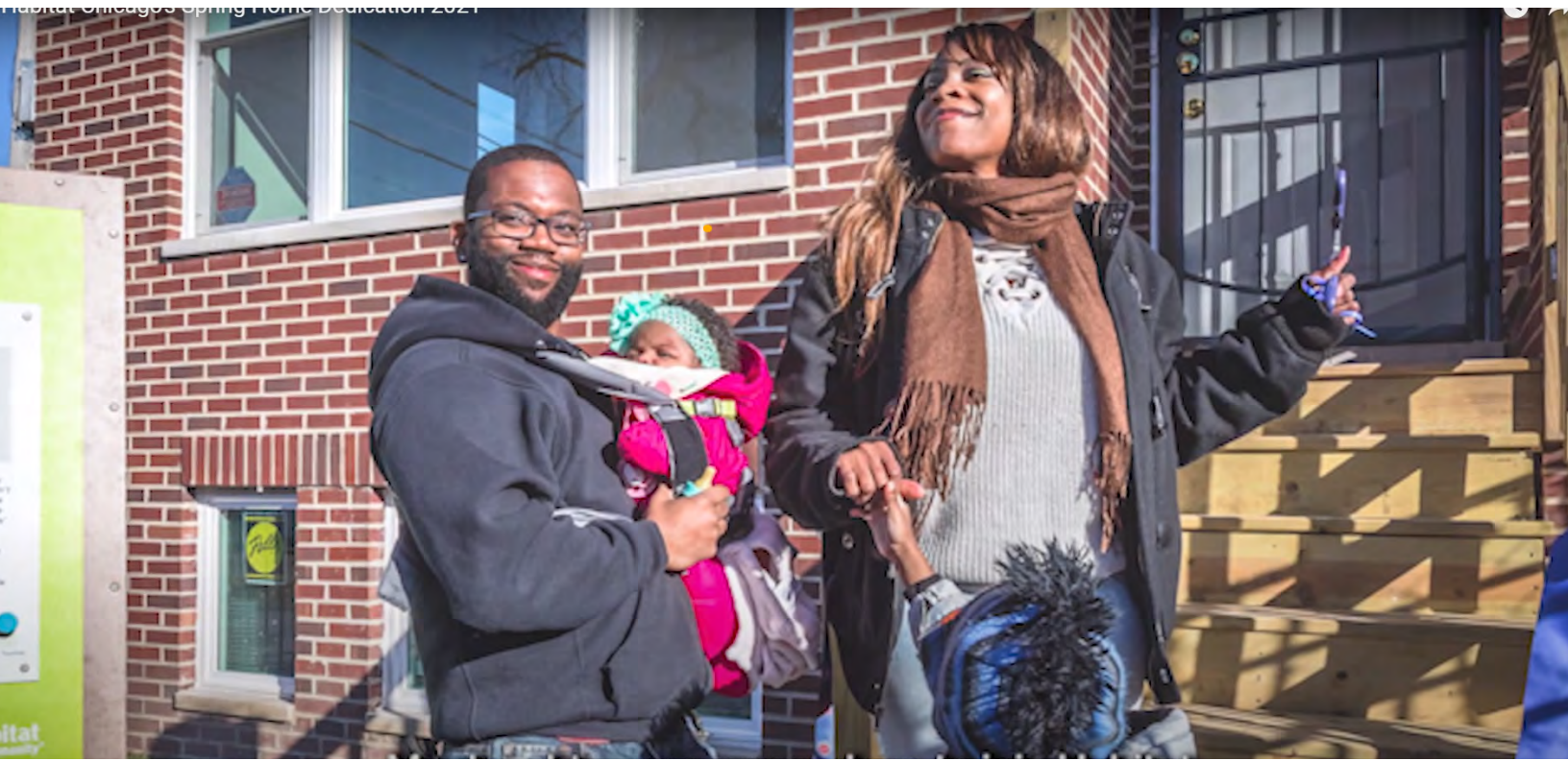
Habitat Chicago's Spring Home Dedication 2021

Habitat Chicago seeks to maximize the impact of our multi-million-dollar, multi-year investments in our focus neighborhoods by building high-quality homes and fostering buyers' intent to pursue long-term homeownership and strengthen their communities.