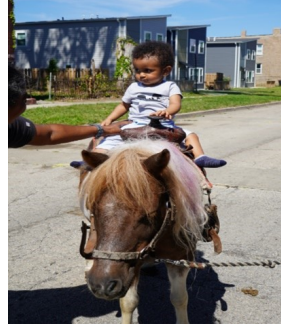
Pictured: Pony rides at 119th/Union block party