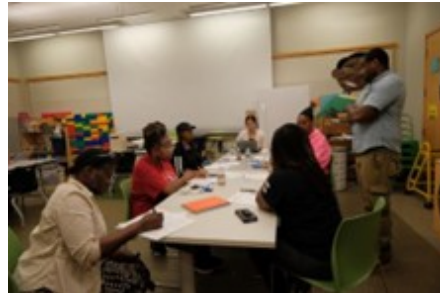
Pictured: Habitat Champions inaugural meeting